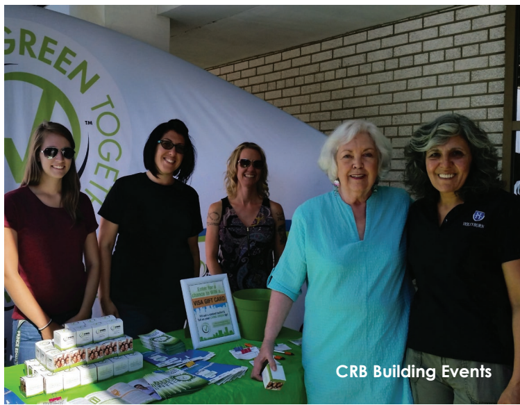
CRB Building Events