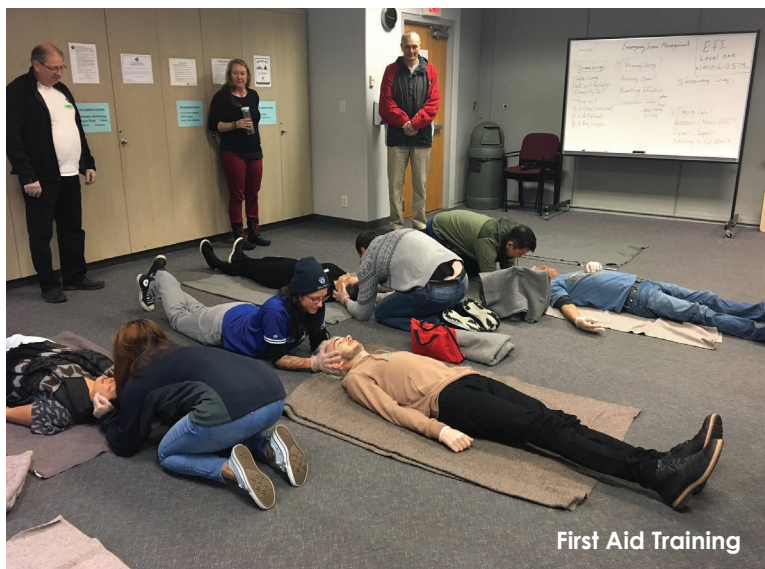
First Aid Training

Pssst here's a secret....the Marketing Team is working hard on redeveloping the existing Hollyburn website to improve the customer experience in a big way! In addition to greatly improved apartment search functionality and user friendliness, a Resident Portal will launch next year for residents to log-in and submit work requests, view laundry machine status, check their rental account activity and much more!