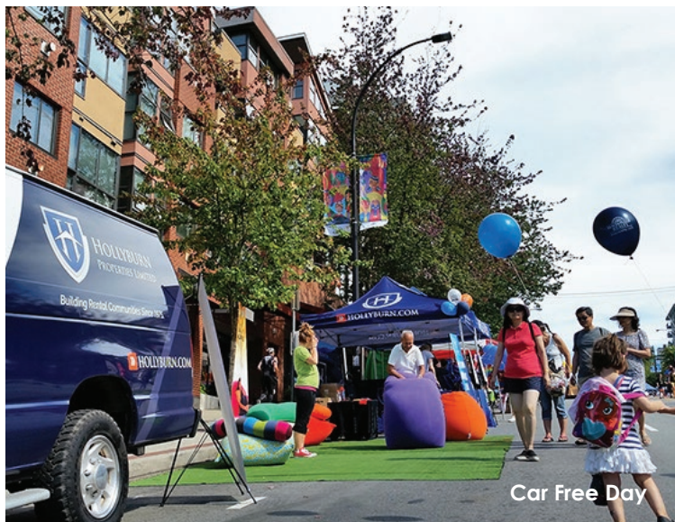
Car Free Day